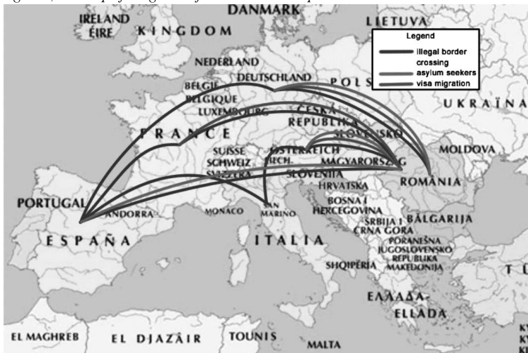
Figure 1, The map of emigration from Romania to Spain